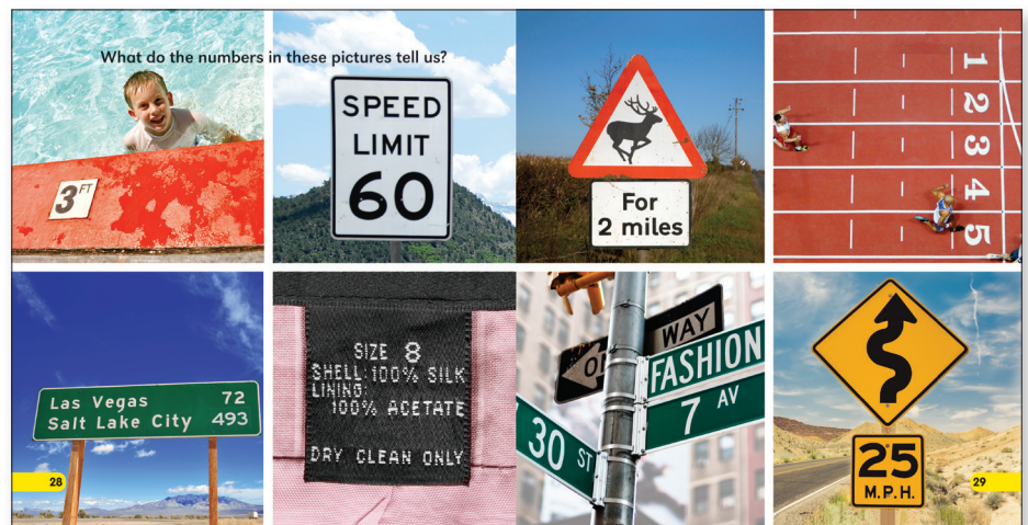
Sample spread from Numbers

English language rights – United States of America, its territories and dependencies, Canada and the Philippines